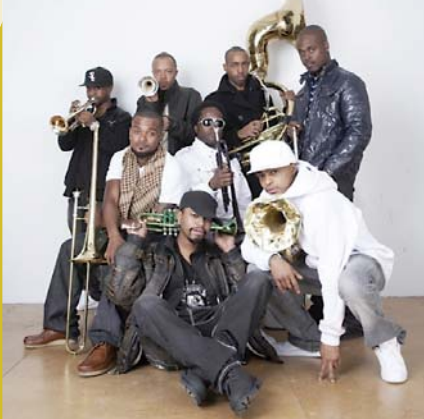
Hypnotic Brass Ensemble

The Lemon Tree, Saturday 17 March, 8.30pm, £15 + booking fee. Tickets: 01224 641122. Standing concert.